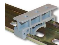
Din Rail Clip